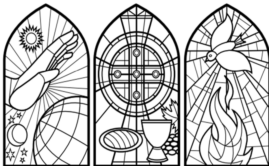
Colour in the Trinity stained glass windows.

CASHLESS PAYMENTS St Oliver's CDFPay for Parish: https://bit.ly/CDFpayPascoeVale OR DIRECT DEPOSIT: St Olivers Church A/C: BSB: 083-347 ACC: 55158 7979 Presbytery A/C: BSB: 083-347 ACC: 53102 0158 LAST WEEKEND'S COLLECTION: Collection Thanksgiving $ 1199.00 2 nd Collection Presbytery $ 467.50 Direct debits APRIL $ 3111.00